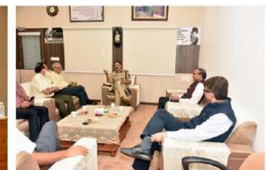
આચાર્ય સામે આરોપો લગાવાઈ 15મી ટીપ્પણ બેઠવામાં આવ્યા હતા.

‘બેસ્ટ કોલેજ ઓફ ઈન્ડિયા’ના સર્વેમાં સુરતની સ્કેટ કોલેજ ઝળકી, દેશમાં સાતમો રેન્ક મેળવ્યો