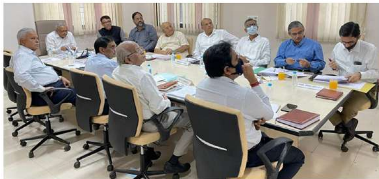
Governing Board Meeting