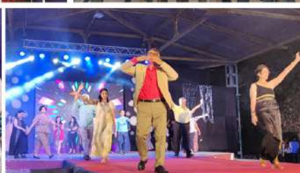
STUDENTS, TEACHERS AND MANAGEMENT PARTICIPATING AND CELEBRATING TOGETHER IN THE STUDENTS ANNUAL FUNCTION — “EUPHORIA”