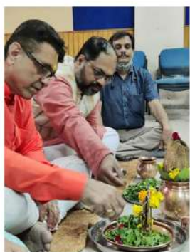
Invoking the blessings of Almighty before beginnings

"Good leaders create a vision, articulate the vision, passionately own the vision, and relentlessly drive it to completion."