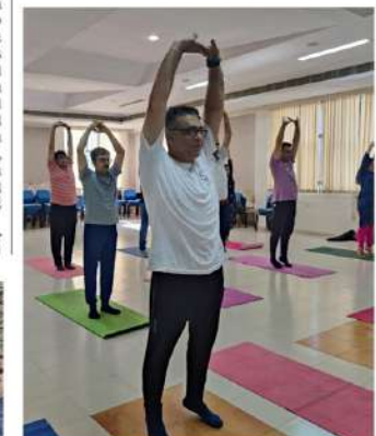
INTERNATIONAL YOGA DAY CELEBRATION AND TREE PLANTATION ON 21 ST JUNE

IDPT - ARCHITECTURE RANKED 7 TH AMONG ALL EMERGING ARCHITEC- TURE COLLEGES, RANKED 9 TH IN PLACE- MENT PARAMETER IN THE ENTIRE COUNTRY. RANKING ASSIGNED BY 'INDIA TODAY' SURVEY